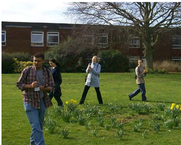
Figure 2. CitiTag in action: a user trial at the Open University's campus