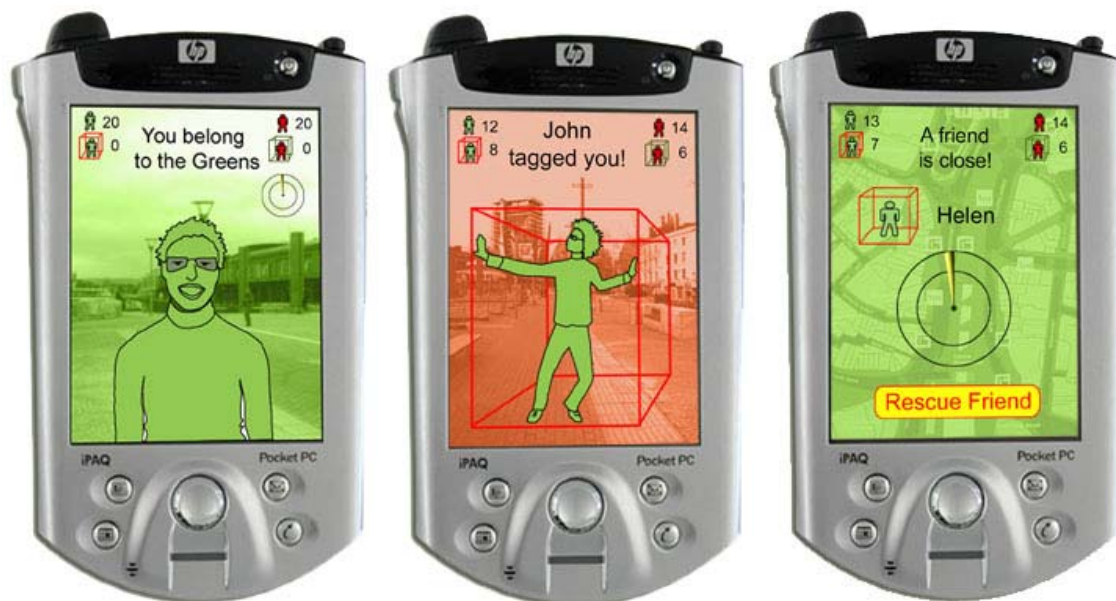
Figure 1. Three different game states. Figures on top of the screen show the number of free and tagged players for each team.

CitiTag is a multiplayer team game. It is played using GPS (Global Positioning System) enabled, handheld, PocketPCs connected to a wireless network. As a player, you belong to either of two teams (Reds or Greens) and you roam the city, trying to find players from the opposite team to 'tag'. When your PocketPC detects a player of the opposite team in the neighbourhood you get the opportunity to 'tag' that player. You can also get 'tagged' if one of them gets close to you. If this happens, you need to try and find someone from your team in vicinity to set you free, 'untag' you. Each game event (e.g. someone is close and you can tag/untag them) appears as an alert on the iPaq with a sound (Fig. 1). A team wins by tagging all of the players on the opposing team.